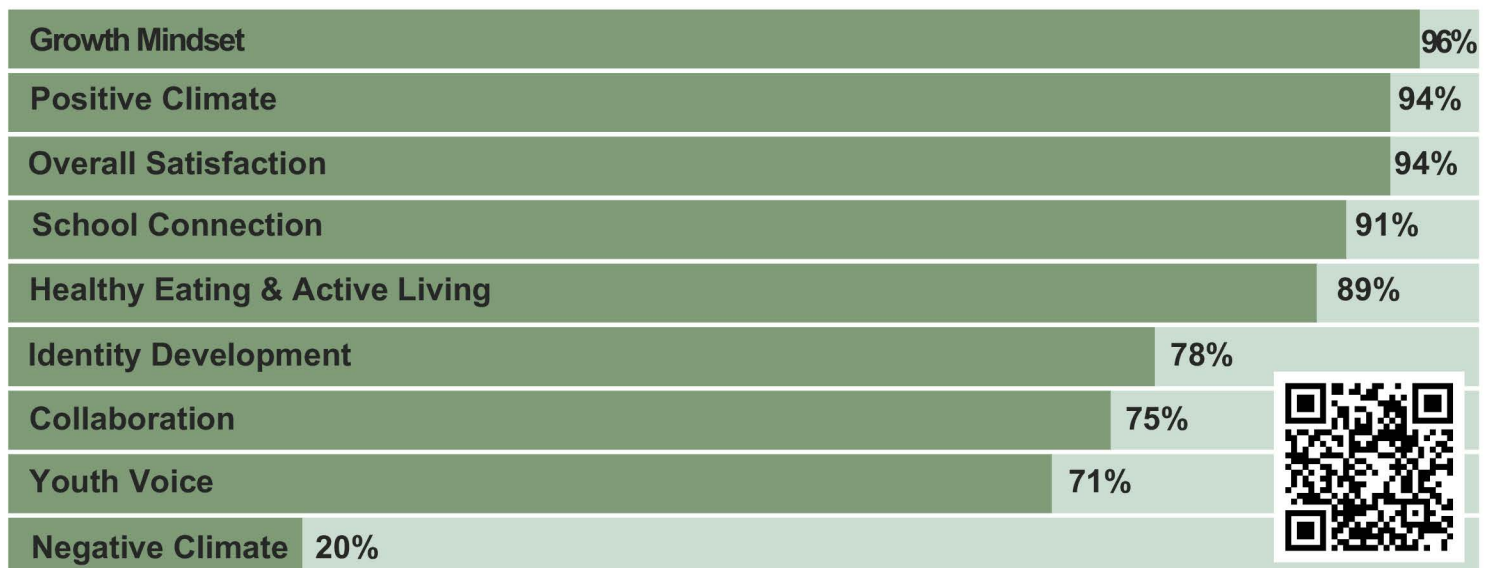
Figure 6. % of Youth Agreed or Strongly Agreed with 32n Programs Providing the Following Experiences:

The survey feedback was overwhelming positive as shown in Figure 6 below. Programs facilitated growth mindset, positive climate, school connection, healthy eating and active living. However, negative climate was experienced by 20% of respondents.