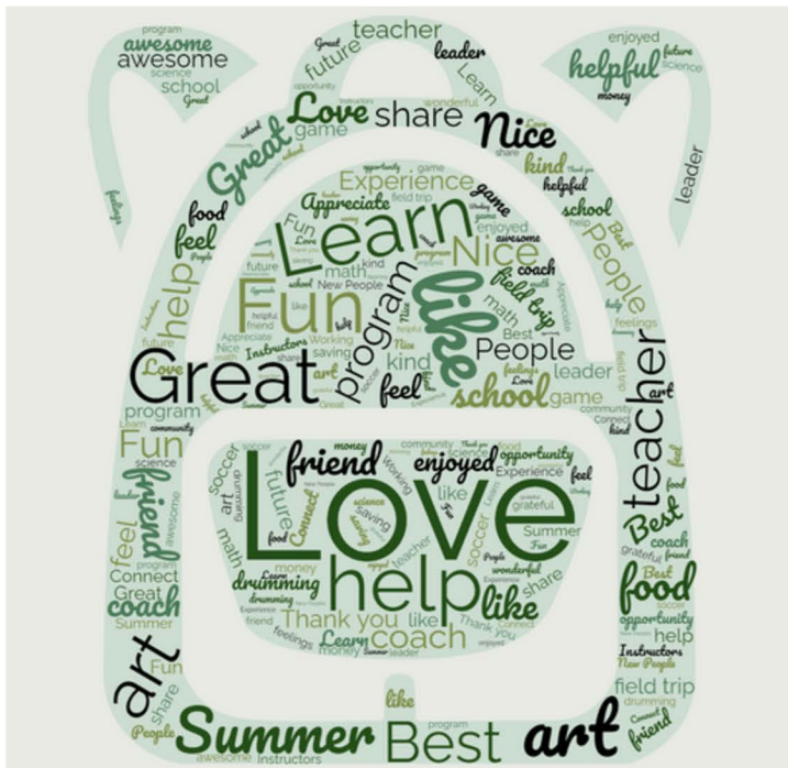
Figure 2. Youth Feedback

Respondents ranged from K to 12th grades, with most between 3rd and 8th grades. See Figure 3 for details.